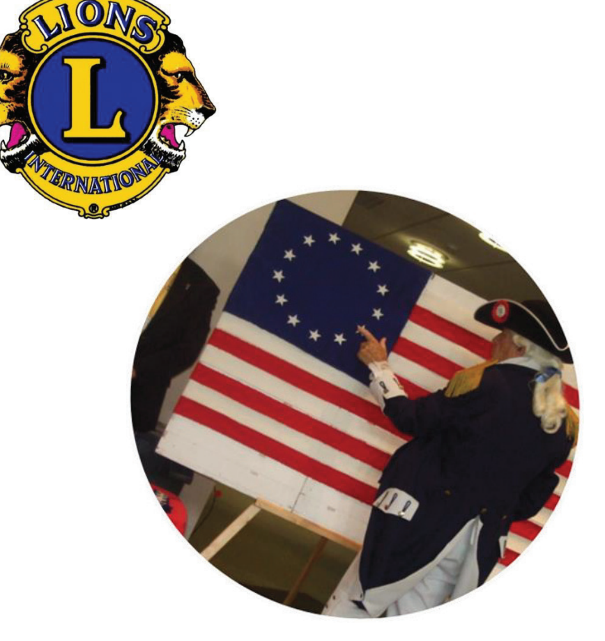
Heroes of '76 present "Building of the Flag"